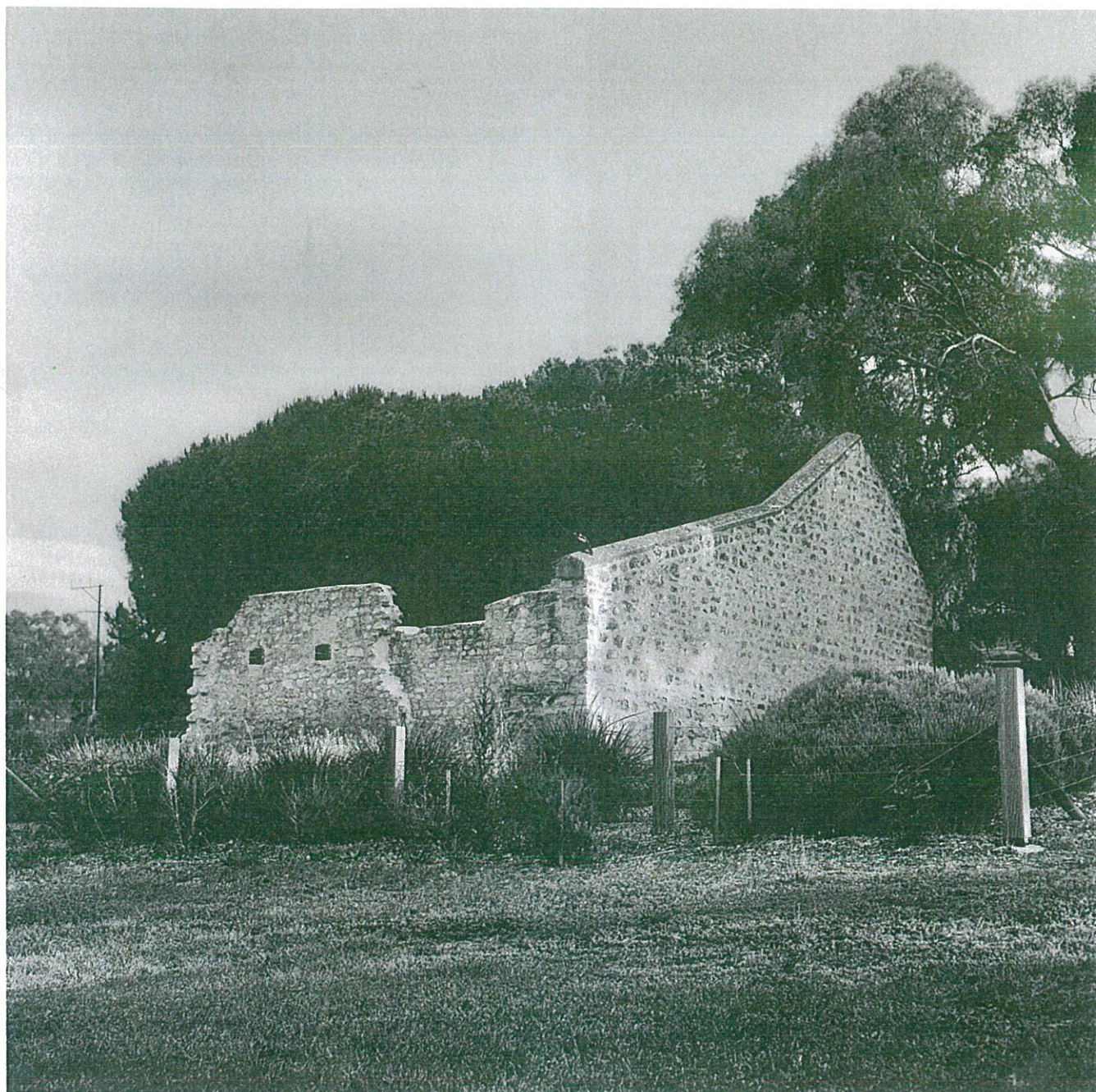
Photo: Martin's Farm, Port Willunga - See Story on page 6.

proudly brought to the community since 1977 by the Aldinga Bay Residents Association